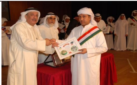
Graduation Ceremony of KCA students