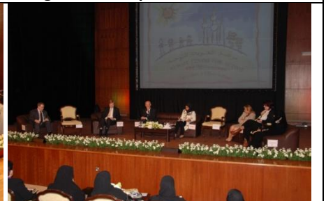
Medical Lecture on Autism conducted in cooperation with Harvard School of Medicine