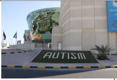
Kuwait Center for Autism (New Building)