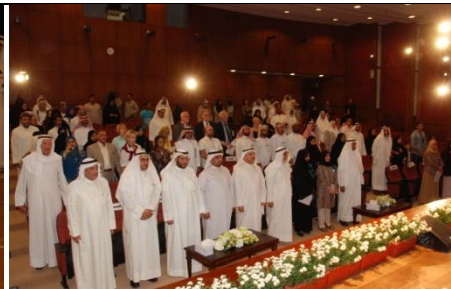
2 nd WAO School Project 2011 participated by delegates from 11 countries