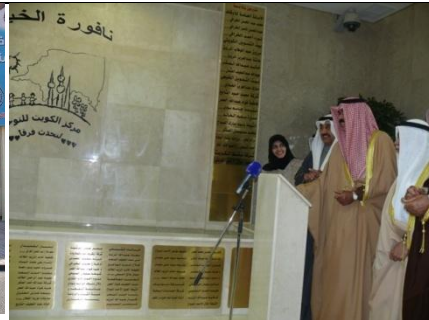
Official launch of the New Building under the auspices of the Amir of Kuwait