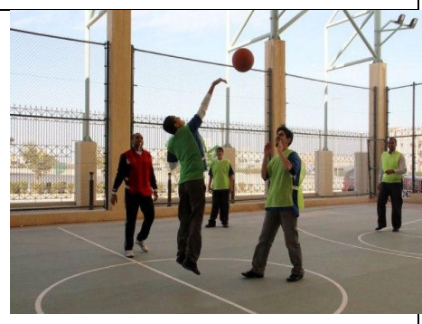
KCA Students in different activities like, academic, art, music, computer, games and sports